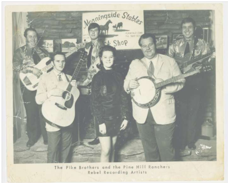
1970: The Pike Brothers and the Pine Hill Ranchers from left to right: